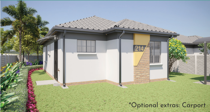
*Optional extras: Carport