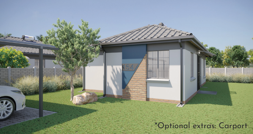
*Optional extras: Carport