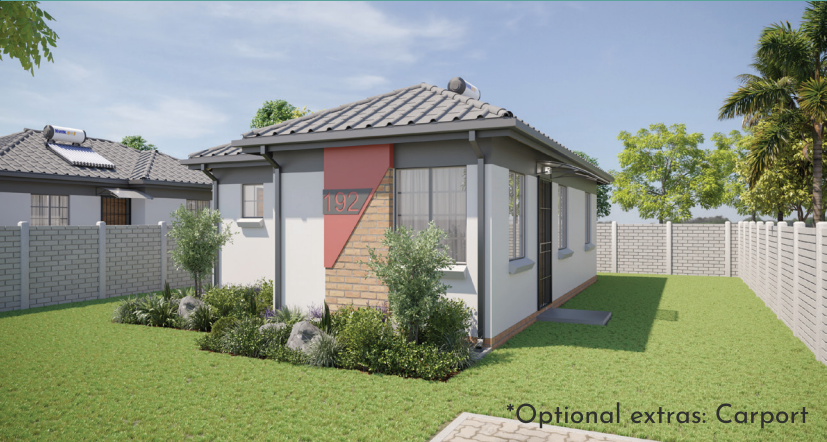
*Optional extras: Carport