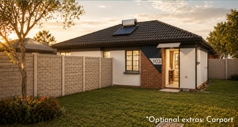
*Optional extras: Carport