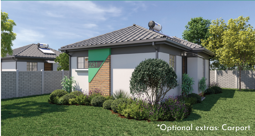
*Optional extras: Carport