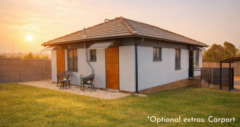
*Optional extras: Carport