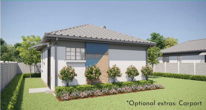
*Optional extras: Carport